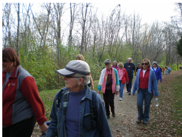
Singles hike, November 2008.