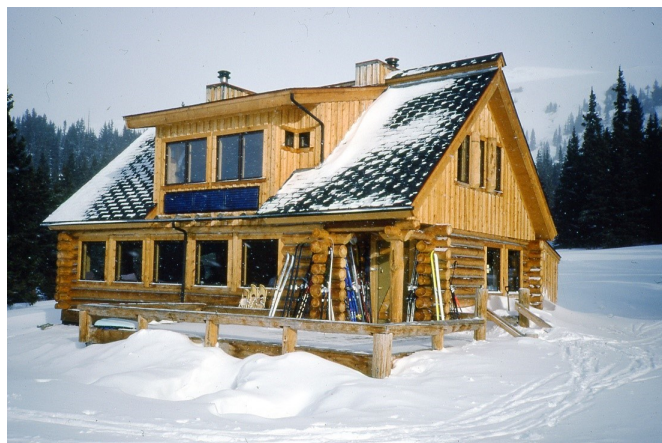
10th Mountain Hut.

Since 1982, 31 huts have come under the control of the 10 th Mountain Division Hut organization. The newer huts are also unique, located below the tree line and with great views of the mountains, especially at sunrise and sunset. They have been built with solar panels, LED lighting, and improved outdoor latrines.