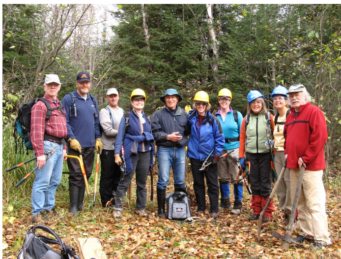
North Stars clearing the Banadad Trail in 2008.

Ted Young, trail administrator for Boundary Country Trekking, stated in a 2005 Loype article, “Ski trails do not just suddenly appear in the north woods, tracked and ready for you to step into your skis and head out. Many hours of labor are required before the first tracks can even be set. In