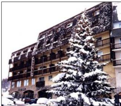
Hotel Sun Valley

The estimated cost of $2350 includes roundtrip airfare between MSP and Barcelona, transfers to Font Romeu and Barcelona, all lodging, breakfasts and dinners in Font Romeu, breakfasts in Barcelona, and cross-country trail passes. Not included are lunches, dinners and attractions in Barcelona, local transportation costs in the Pyrenees and Barcelona, and luggage fees.