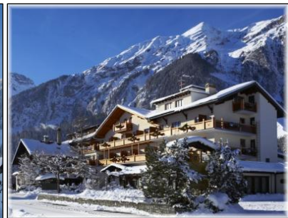
HOTEL ALFA SOLEIL

Estimated cost of $2250 includes airfare between